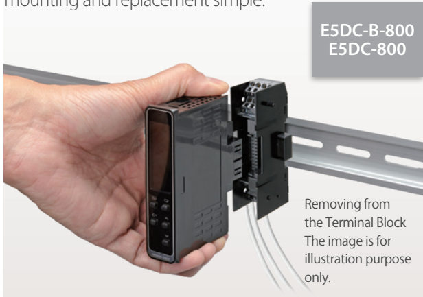
*Hooks must be pressed to remove from the terminal block.

The removable terminal block means wiring does not need to be removed during maintenance, making mounting and replacement simple.